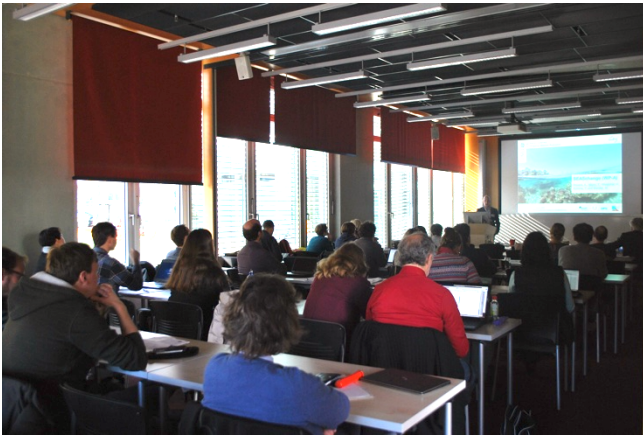
Fig 2: The 2 nd annual gathering of the SPP SeaLevel at CEN/Institute of Oceanography, University of Hamburg on 19-21 March 2018.

the SPP SeaLevel, namely the Northeast Atlantic with the North and Baltic Seas, and the Southeast Asia and Indonesia region, impacts in these regions, as well as developments on adaptation options and different pathways, decision analysis and governance.