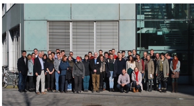
Fig. 1: The participants of the 2 nd SPP-1889 SeaLevel Annual Meeting (March 2018, CEN/ Institute of Oceanography, University of Hamburg).

Thanks for your interest in the SeaLevel program!