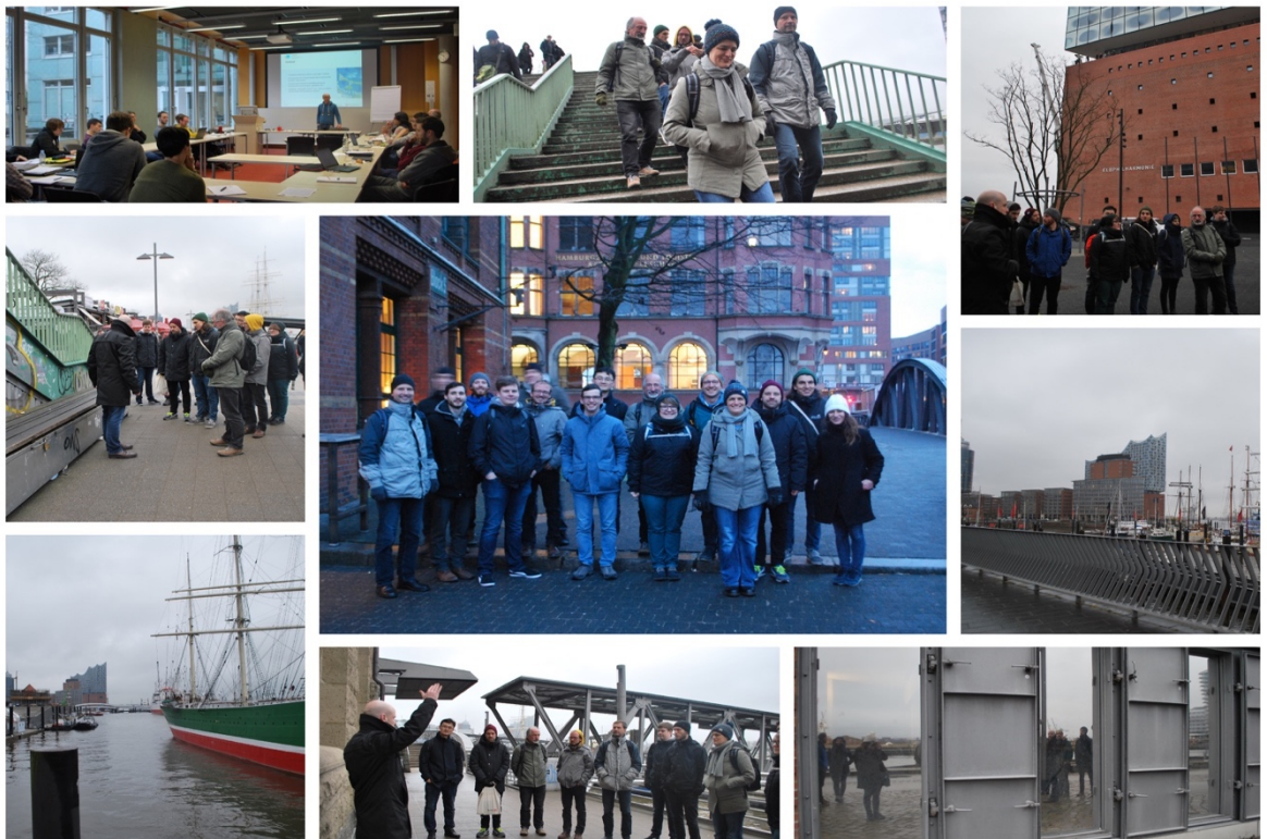
Fig 4: Snapshots from the 1 st Early Career Scientists Meeting of the SPP SeaLevel and their excursion in Hamburg waterfront to visit the storm surge and flood protection cites of the city.

Benefiting from the expertise of SPP Principal Investigators (PIs), the ECS meeting further included lectures on key sea level topics. Jochen Hinkel (Global Climate Forum, Potsdam) discussed to what extent the coastal societies are able to adapt to sea level rise, and what kind of sea level information are required for coastal adaptation and risk management, and Tilo Schöne (German Research Centre for Geosciences-Helmholtz Centre Potsdam (GFZ)), gave a lecture on measuring sea level with different tools and getting a consistent reference frame.