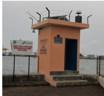
Fig 7: Tide gauge in Semarang 2012.

A site survey in the highly effected areas of Semarang reveals to what extent the population is affected by this development. Some streets were uplifted frequently every 2 years by 20 cm. The houses appear to be 'sinking', while the street level appears to be 'rising'. Fig 9 shows an inhabited house with an eaves height of ~1,20 m. The uplift of the street level clearly deteriorates the situation, since the water has nowhere else to go except into the low-lying houses.