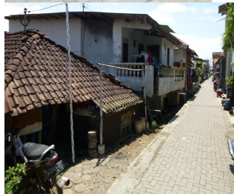
Fig 9: 'Sinking' houses Semarang 2018 The roof of the house in the foreground is just 1,20m above street level. The 1th floor balcony of the next house now serves as entrance, while the ground floor serves as basement. (©Julia Illigner).