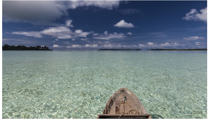
Fig 10: Central Java, Indonesia.

Sea level rise and flooding on the north coast of Central Java. Physical causes and social adaptation Coastal floods and their causes and consequences can be understood as coupled socio-ecological systems. The pattern of regional sea level rise in Indonesia is highly divergent, showing rates from -5 to more than +10 cm per annum. In Semarang, the capital of Central Java, GNSS-corrected tide gauge data show a strong rise of the local sea level of 10 cm per annum. This rise of the local sea level is mainly caused by land subsidence, which is due to tectonic instabilities, excessive groundwater withdrawal and increased surface load. As a consequence of the subsiding land surface, low-lying urban districts are faced with frequent tidal and river floods. So far, local people in Semarang have been able to cope with these