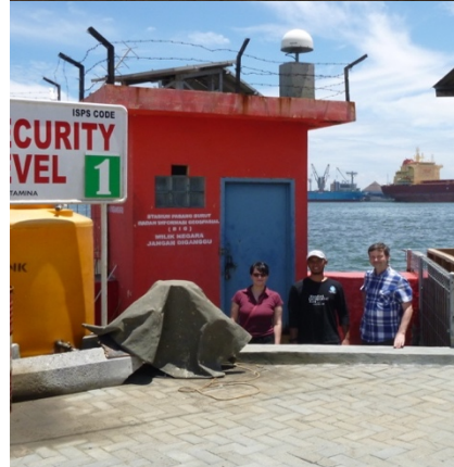
Fig 8: Tide gauge in Semarang 2018.