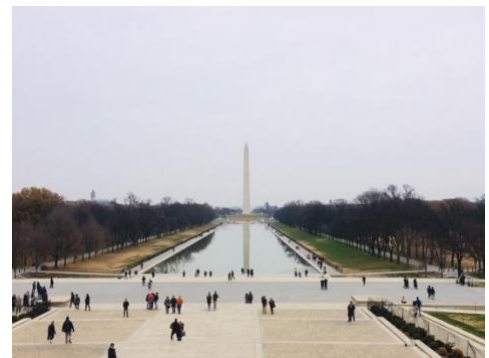
Figs 6-8: The AGU Fall Meeting took place in Washington D.C. in December 2018, bringing together over 40000 scientists from the Earth and space sciences.

The AGU Fall meeting, the largest Earth and space science gathering in the world, took place in Washington D.C. on 10-14 December 2018, marking also the beginning of AGU’s Centennial in 2019, a time to reflect on the meaning of a century of discovery and its contribution to inform policy decisions, spark innovation, and protect health and welfare of people globally.