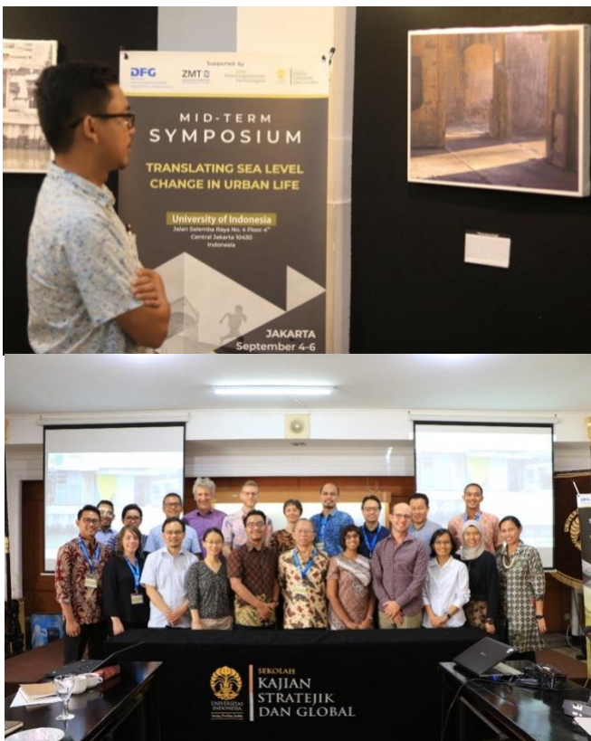
Fig 4 & 5: EMERSA public photo exhibition and symposium participants, together with the hosts and project partners at Universitas Indonesia (UI), Jakarta.

The volume will bring together much of the original material that was presented at the workshop, together with a number of new collaboration partners.