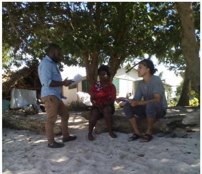
Fig 3: Interview with a woman living on the coastline in Bougainville.

The next step of DICES is to investigate people's preferences for coastal adaptation measures and the overall potential of ecosystem-based coastal protection measures on the two case study islands.