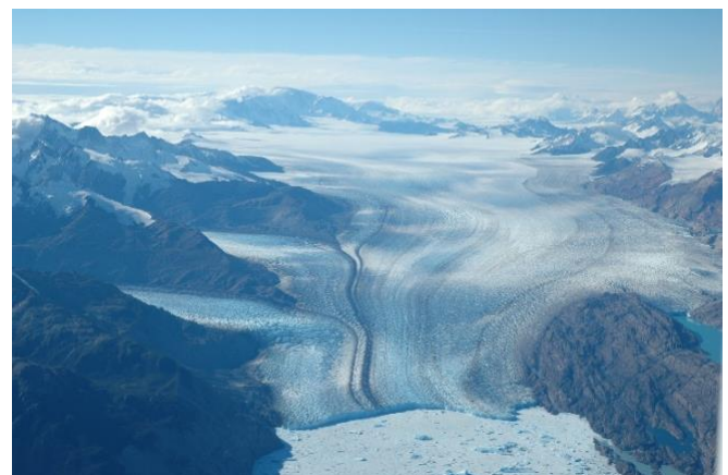
Fig 1: The Uppsala Glacier, the largest glacier in South America in Argentina, flows into Lago Argentino. When such outlet glaciers shrink, they first have to form a stable front again, which can stop the masses of ice flowing downstream.

We hope you enjoy reading the SPP SeaLevel Newsletter and thank you for your interest to our program and research activities!